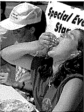
"CARS" Pr... (2006/5/29)