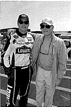
"CARS" Pr... (2006/5/29)

nuclear energy divisions in Wilmington, creating 200 jobs;